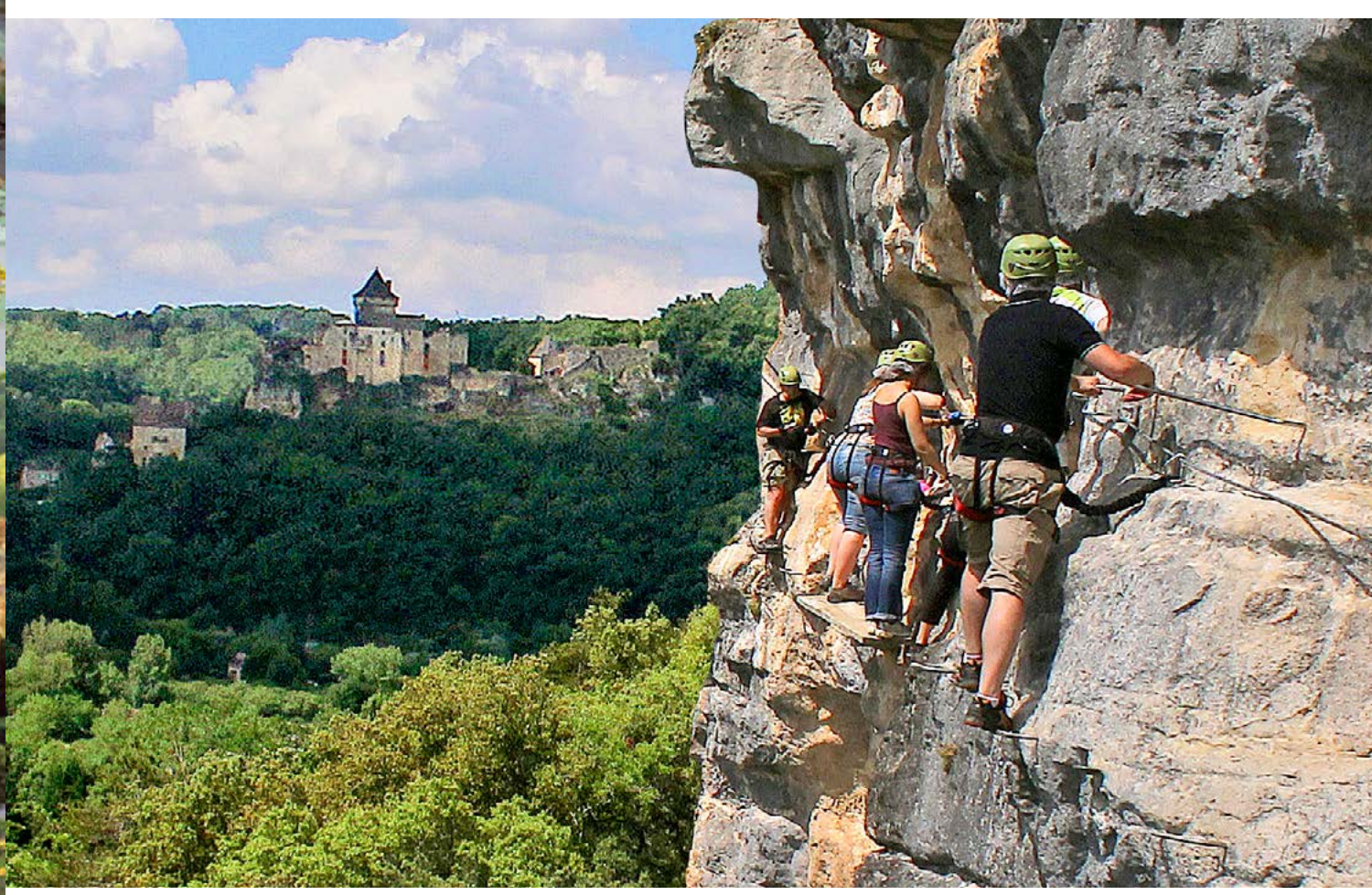
THE VIA FERRATA

Gardens of Marqueyssac are also unanimous among thrill-seekers.